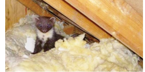
Pine marten kit in roof space

Although the pine marten is one of our more attractive native mammals, they do not make good house guests, for the reasons already discussed.