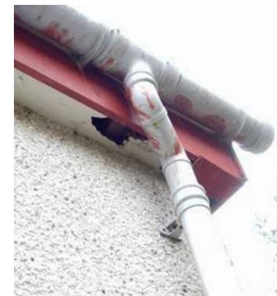
A potential access hole for a marten