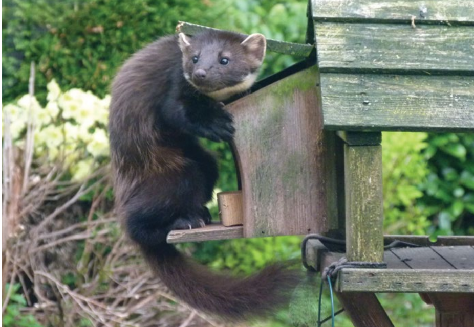
Pine marten on a squirrel feeder

The presence of a female marten and her young in a building can also give rise to problems of smell and hygiene and possibly also structural damage, e.g. when a marten enlarges an existing small gap to gain access to the building. Adult martens do not live in pairs, so if more than one animal is present, it will almost certainly be a female with young. Due to the risk of a female abandoning her kits if disturbed, no action should be taken to exclude or deter a pine marten from a building between the months of March to July. Such action could constitute an offence. If in doubt contact your local NPWS ranger.